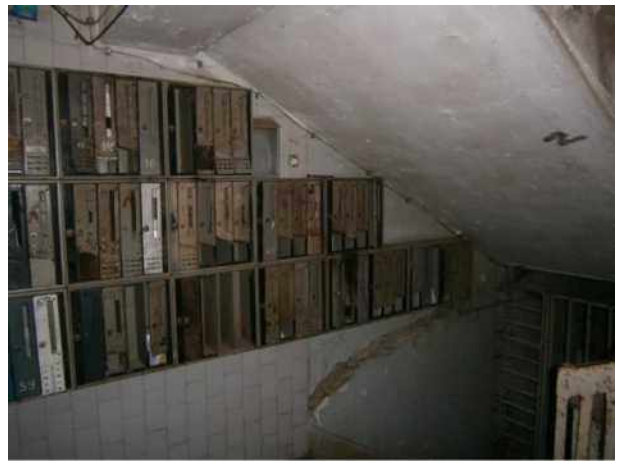
Condition of letterboxes in a building constructed in the 1980s

The field inspection showed that all of the older buildings have installed letterboxes, but their condition varies from good to very bad (some completely destroyed). It was noticed that most of the letterboxes have similar dimensions (produced in accordance with the former Yugoslav standard), although these are not in line with the current EN 13724 standard. The individual houses that were visited all had letterboxes with various shapes and sizes. It was concluded that although all of them were in good condition, they do not comply with the EU standard. The MS experts were satisfied with the information