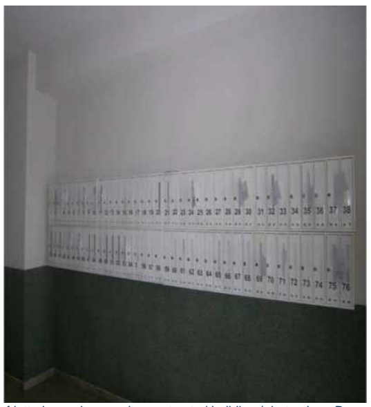
Condition of letterboxes in a newly constructed building

For the purposes of the project and upon the request of the Postal Agency and prior to the visit, the Post of North Macedonia conducted a field measurement of the postal operations and condition.