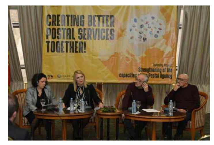
Spanish experts, together with the Director of the Postal Agency (project photo)

The purpose of introducing standards for the letterboxes is intended to ensure the quality and safety of products and/or services; comply with relevant legislation including EU regulations; achieve compatibility between products and/or components; access markets and sell to customers in other countries in and outside Europe; satisfy the customers' expectations and requirements; reduce costs, eliminate waste and improve efficiency; and gain knowledge about new technologies and innovations.