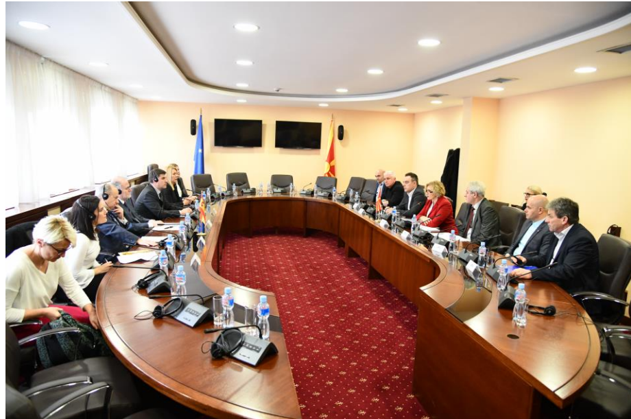
Meeting at the Parliament of the Republic of North Macedonia

This project is funded by the European Union